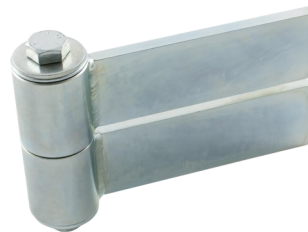
CI3900 & CI3925